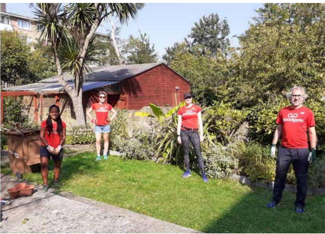
on behalf of Brockley's Posties